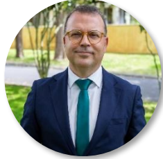
João C. A. Teixeira School of Business and Economics, University of the Azores, Portugal